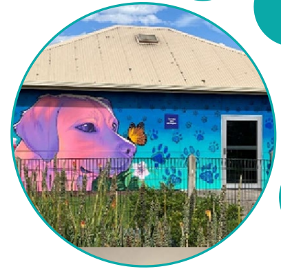
A mural of MacKillop's first therapy dog, Millie at our Maidstone campus.